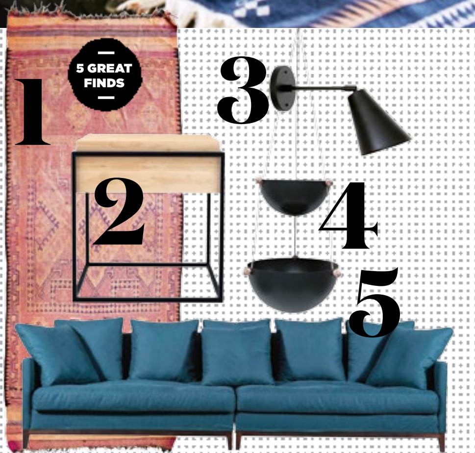
1. 'Evil Eye' Vintage Boujad rug, $1750, Tigmi Trading, tigmitrading.com. 2. Universo Positivo bedside, $525, GlobeWest, globevest.com.au. 3. 'Tilt Cone' sconce, US$199, Cedar & Moss, cedarandmoss.com. 4. Oyoy 'Pif Paf Puf' double hanging planter, $198, Designstuff, designstuff.com.au. 5. 'Banjo' occasional sofa, $4900, MCM House, mcmhouse.com.