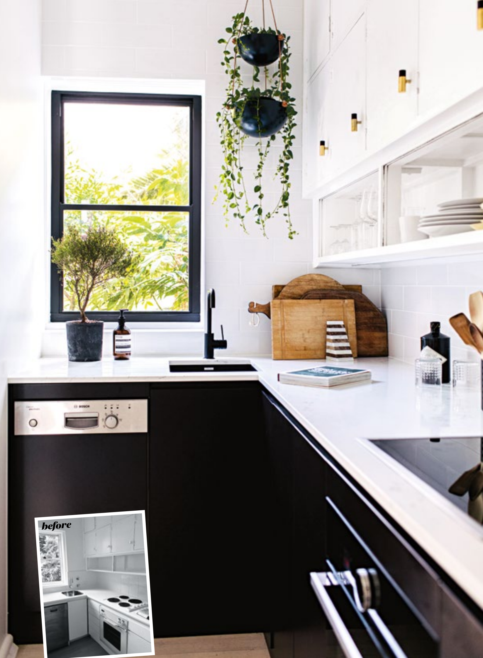
ARTWORK (RIGHT) PAINT COLOUR MAY VARY ON APPLICATION